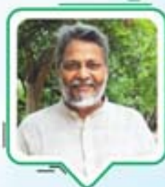
Dr. Rajendra Singh Founder Tarun Bharat Sangh