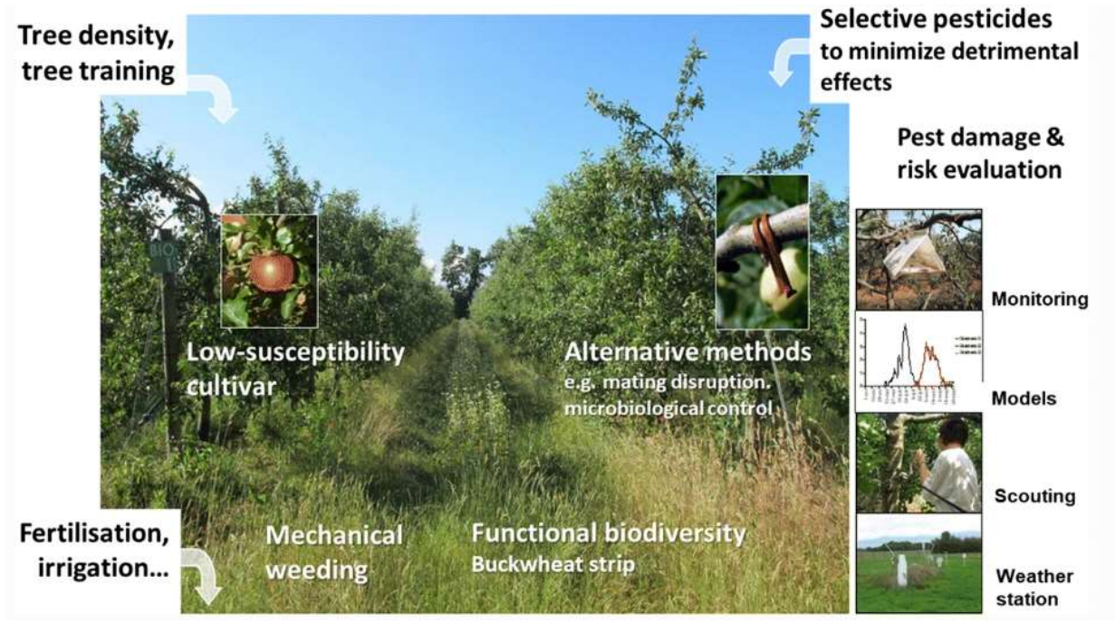
Fig. 3 Integrating different methods to achieve pome fruit protection against pests, diseases, and weeds (adapted from Simon et al. (2017a) [23]

Figure 3 presents an ideal situation of integrated protection in an apple orchard. This theoretical range of integration has rarely been tested in the field. In reality, IPM has often been a juxtaposition of different crop protection techniques [22]